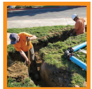
Water main repairs and installations.